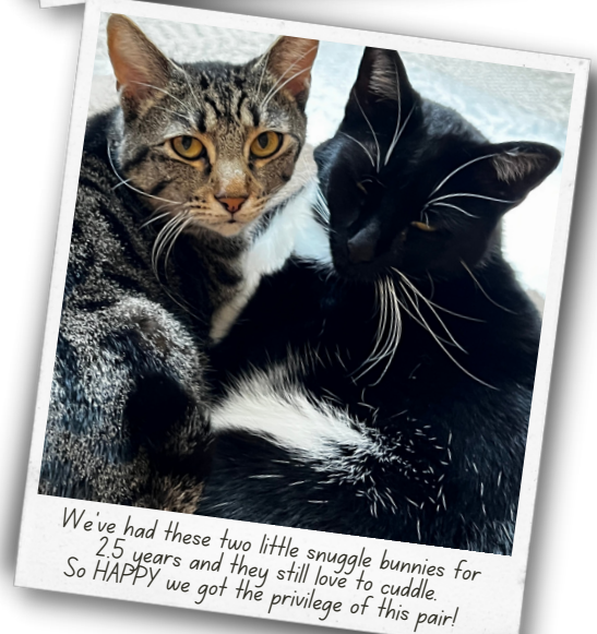
We've had these two little snuggle bunnies for 2.5 years and they still love to cuddle. So HAPPY we got the privilege of this pair!