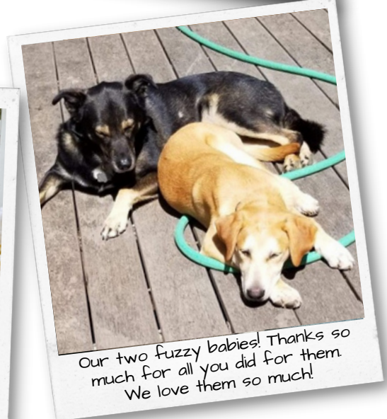
Our two fuzzy babies! Thanks so much for all you did for them. We love them so much!