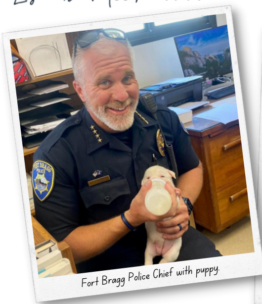
Fort Bragg Police Chief with puppy