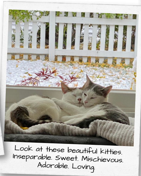
Look at these beautiful Kitties. Inseparable. Sweet. Mischievous. Adorable. Loving.