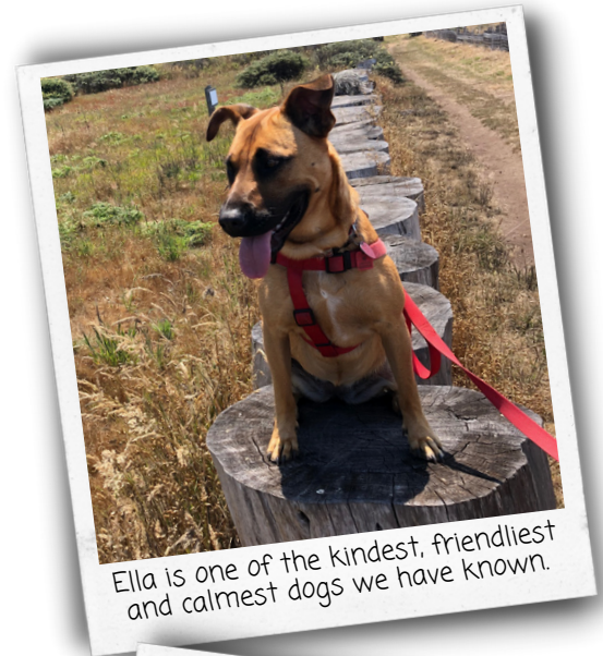
Ella is one of the kindest, friendliest and calmest dogs we have known.